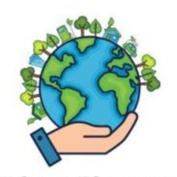
Prizes, Giveaways Good for Earth