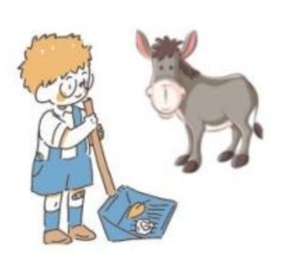
Scavenger Litter Hunt with Cinnabon