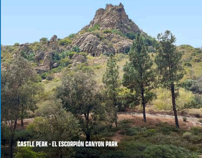
CASTLE PEAK - EL ESCORPIÓN CANYON PARK