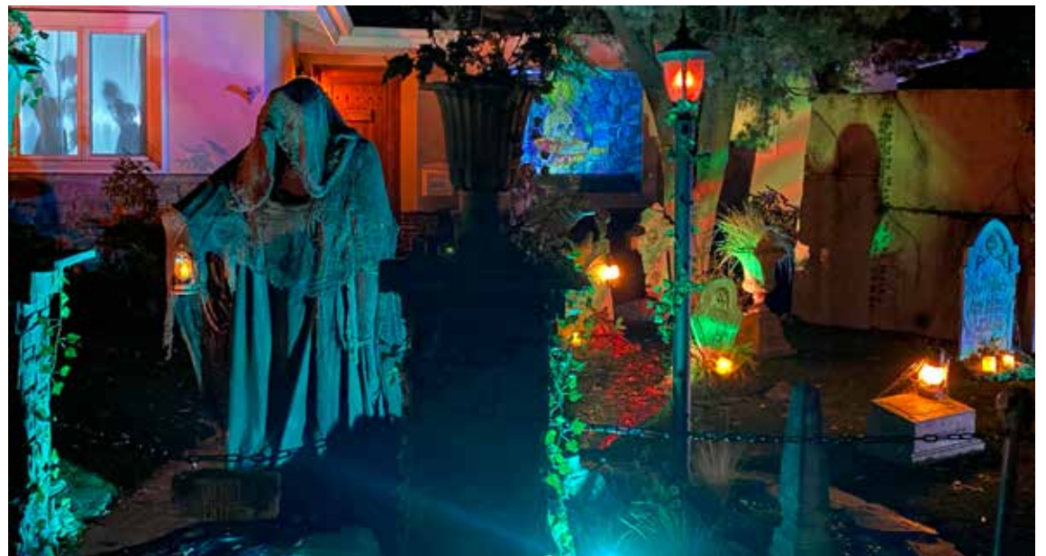
Winning in the "scary" category was this home on Melba Avenue.

Daylight Saving Time ends this Sunday, November 1, at 2 am. Turn your clocks back one hour and get an extra hour of sleep!